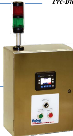
Control Panel with Stainless Steel Enclosure and Grid Brush Control Options